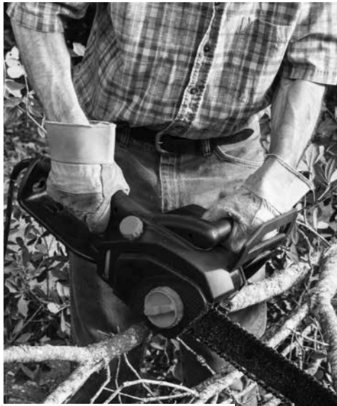
Wear protective gear for cleanup work