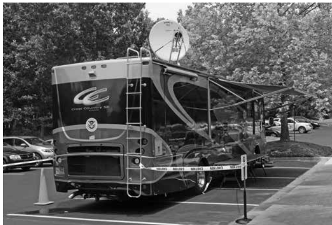
ABOVE: Mobile Disaster Recovery Center vehicle is on display in front of the FEMA/ State Joint Field Office in Tallahassee.